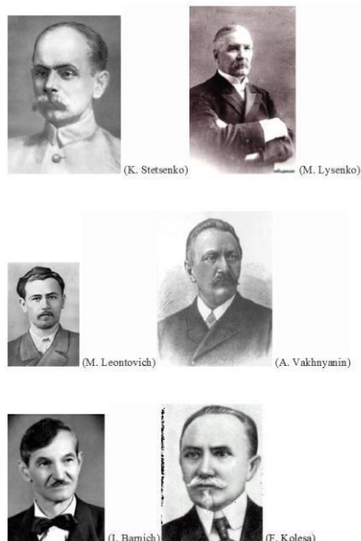
Pic.2 Ukrainian composers of the late 19th and early 20th century

Careful, thoughtful listening vocal works by Ukrainian composers helps students through the prism of musical intonations inherent Ukrainian music, including our folklore, experience the beauty of vocal heritage of Ukrainian composers. In the process of perception, analysis and study any vocal work of Ukrainian composer, high school student pass him through itself, absorbing new "colors" of emotions, universal values of beauty, goodness, contributing to the formation of his artistic tastes of established national music (Pic.2).