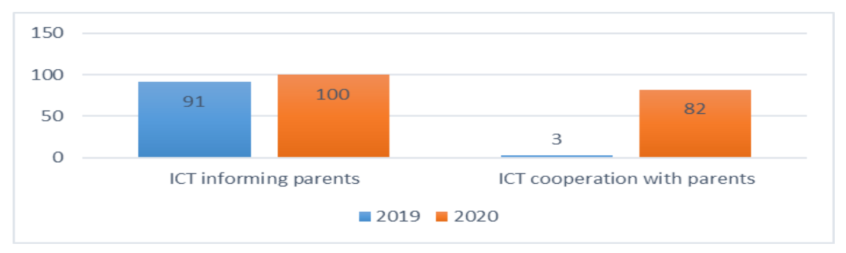
Fig. 2. The results of the study of the activity level of teachers using ICT technology with parents.

adding video hosting YouTube (72%), virtual board Padlet (26%), 35% of respondents said that they use various mobile services to create videos, collages, posters.