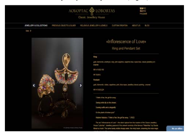
Fig. 5. Website of Classic Jewelry House "Lobortas". Avaiable at: https://lobortas.com/en/

The giants of jewelry in Ukraine, known for their highly artistic works of the VIP class, include the Classic Jewelry House Lobortas, whose catalog website can also be an excellent example of the great importance of a successful presentation of jewelry, especially when it comes to exclusive works created from expensive materials, in such cases, the competent presentation of the material is an indicator of taste, quality and reputation (Fig. 5).