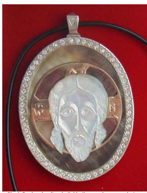
Fig. 1. Pendant, handiwork. Gold, silver, mother-on-pearl, zircons, engraving. Author: Viktor Romanenkov.

However, they are all united by one feature - they very quickly become obsolete, lose their relevance and go out of use, such as JewelCAD, RhinoGold, Autodesk ArtCAM, JewelSmith, from the first programs for modeling jewelry [14], which are also used in the Ukrainian jewelry market. Not all programs are designed purely for the jewelry industry, there are those that are used for this purpose, among others (SolidWorks, Fusion 360). Rhinoceros, the software for three-dimensional NURBS-modeling, is most often cited as the favorite in this row (Fig.2). However, there are a number of specialized programs, although even today there are not so many of them. Among the most used are MatrixGold [14], 3Design, Firestorm, JCD (Jewelry CAD Dream), Maya, Modo.