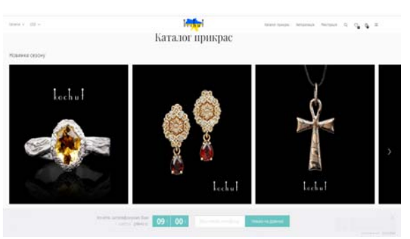
Fig. 4. Website of Ukrainian jewelry brand "Kochut". Avaiable at: https://kochut.org/uk/

Any jewelry brand has its own website, which functions as a catalog, where you can get acquainted with the assortment, choose a product for yourself and order it, or contact the master to order a similar product, but according to individual parameters (change the size, choose another metal, stone). Ukrainian brands Zarina, Kochut (Fig. 4), CDD Jewelry, etc. are known largely due to their presentation on the network – shop-websites, catalog-websites, pages in Instagram, Facebook.