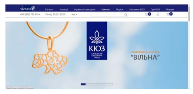
Fig. 3. Website of Kyiv Jewelry Factory. Avaiable at: <u>https://kuz.ua/</u>

But there are a number of areas where the use of computer technologies, the Internet has positive results only. Any product needs advertising promotion in order to be favorably presented to the buyer. For this purpose, the Internet has been of invaluable help, especially since the pandemic, COVID-19 took away the opportunity for people to visit exhibitions and shops frequently. Purchasing power has plummeted, changing the value system of people, and since jewelry is a luxury item, there is very little chance of selling it if it was not originally made to order. Therefore, it is especially important to create favorable conditions for the presentation of the product in order to attract interest to it. For these purposes, individual websites of jewelry artists, websites of shops, jewelry houses, factories (Fig. 3), even social networks serve.