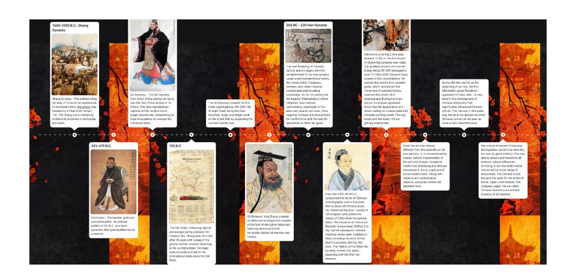
Figure 5: The timeline visualization method

critical analysis through qualitative assessment of preconditions, development trends, cause-consequence effects, socio-ethical dimensions imply forming basic professional competences of the academic research in history and archaeology. The timeline visualization method represented as a student's task answer in Figure 5 reveals an applicable way to synthesize the content within multimodal operators at the project presentation stage.