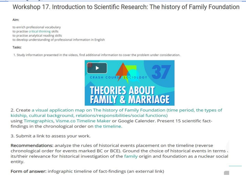
Figure 4: Historical investigation of the family origin and development

The key issue here is the view that students present in their historical narratives defining the historical events sequencing in the timeline, grounding their significance, continuity and change, cause and consequence, historical perspective-taking, the social and ethical dimension. Infographic timeline on the history of family foundation is seen as a result of the cognitive competences application through the research collaboration across different subject area fields. Linguistic competence skills are considerably improved via «mediation competences» (Pop, & Mazilescu, 2012, p. 4203) comprising identification and interpretation of topics, terminology, discourse structures, graphical and visual elements correspondence, retrieving, selecting, processing relevant information on the given topic, deploying search engines for data base, summarising text on paragraphs, extraction and paraphrasing, establishing translation equivalences, etc.