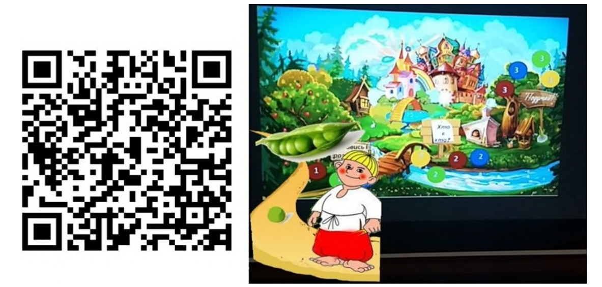
Figure 6: Activation of the interactive part of the travel map "Look and tell". Fragment "Appearance of Kotygoroshko".

The first stop of the game trip is dedicated to retelling a fairy tale. According to the stop's name, performing the actions "Look and tell" is suggested. Each group of students "animates" the circle of the corresponding colour, and a fragment that needs to be transferred appears on the smartphone. The group of students is offered the task of making a plan for retelling a fragment of a fairy tale visualised with the help of an AR application and determining the speakers according to the plan. The teams were offered the following fragments: "Red" – a fragment of "Brothers and sister have disappeared"; "Yellow" – a fragment of the "Appearance of Kotygoroshko"; "Green" – a fragment of "Battle"; "Blue" – a fragment of "Betrail of brothers".