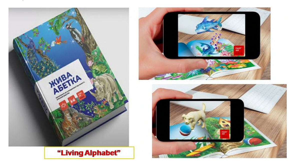
Figure 1: Demonstration of augmented reality according to the publication "Living Alphabet".

with the application FastAR Kids for smartphones and tablets (iOS, Android). The alphabet pages can be revived from the first literacy lessons (figure 1). While working with this alphabet, we offer first-graders not only to listen to poems, fairy tales, and helpful information but also advise teachers to set the following tasks for students: observe the heroes of stories, learn to interact with them, explore their appearance and emotional state, pay attention to the environment, orally describe what was seen and heard, etc.