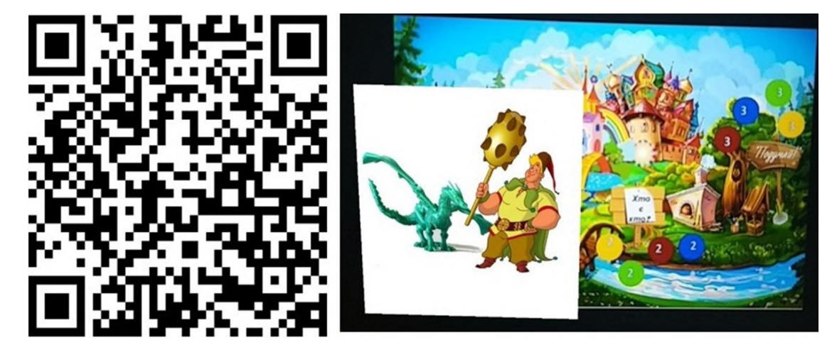
Figure 5: Activation of the interactive part of the travel map "Look and tell". Fragment "Battle".