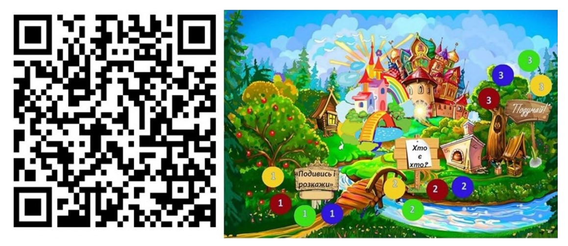
Figure 4: Inter active map of the game-trip for the activation of the AR applications under the fairy tail "Kotygoroshko".

The basis of the game-trip is a fairy tale map with stations and special interactive tags – circles of different colours (figure 4).