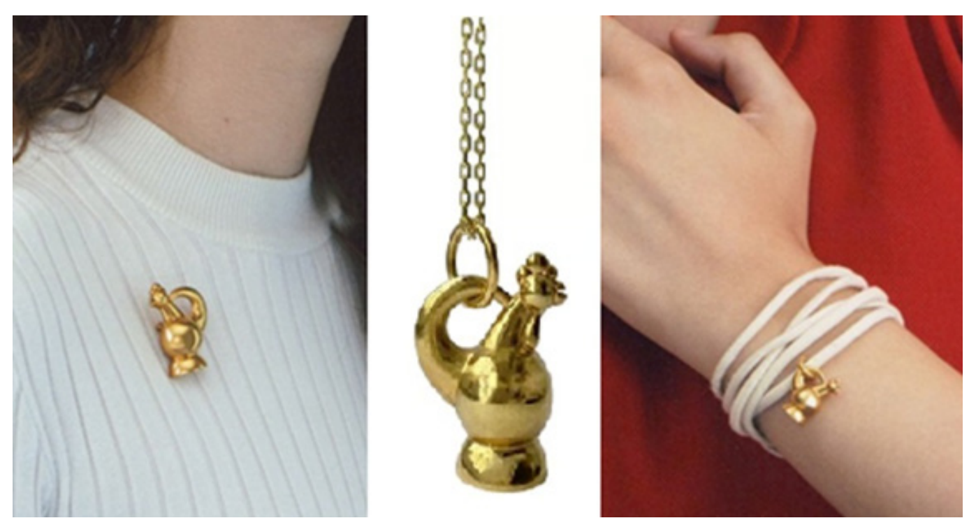
Figure 5. "Cockerel from Borodyanka" as brooches, pendants, bracelets.

also a change in the composition of its creative elite. Many artists found themselves either on the front line or in the ranks of the territorial defense. But guns did not silence the muses. Those masters who remained immersed in life on the home front continued to work with redoubled activity, if not to call it aggression. They were driven by pain, hatred, desire to win, to liberate the country, to protect their loved ones. "Freedom", "independence", "victory", "peace" became key messages. Many previously mundane categories have acquired a completely different semantic content, such as, for example, "silence", the value of which is now "worth its weight in gold" in Ukraine. Silence now means the absence of missiles, drones, fighters, and the sound of sirens piercing the air. There were many musicians, artists, actors, filmmakers at the forefront for whom weapons are now the main tool of self-expression. But their colleagues who have not taken up arms have turned to art as their weapon. Consequently, a cultural front has been formed, with an equal influence on the viewer's mind. Visual art shifted its focus towards plot: there were no more complicated philosophical meanings in the works. Instead, there appeared a call, a cry, pain, but the main idea conveyed to the public in countries around the world became the power of spirit, the moral strength