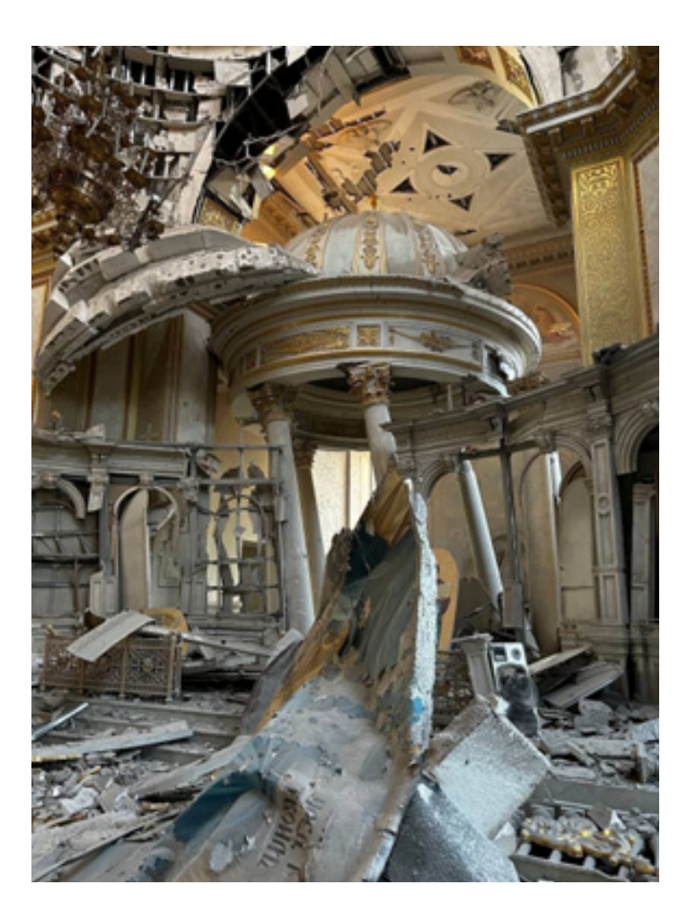
Figure 1. Ruins of the 18th century Transfiguration Cathedral in the city of Odesa. Photo posted on social media by the Odessans on July 23, 2023.