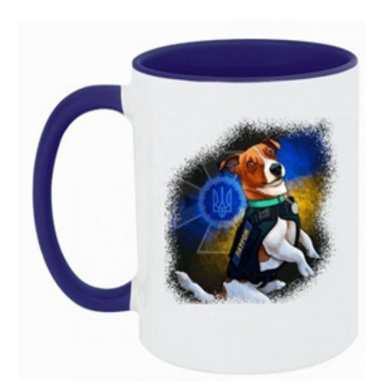
Figure 7. Souvenir cup "Dog Patron".