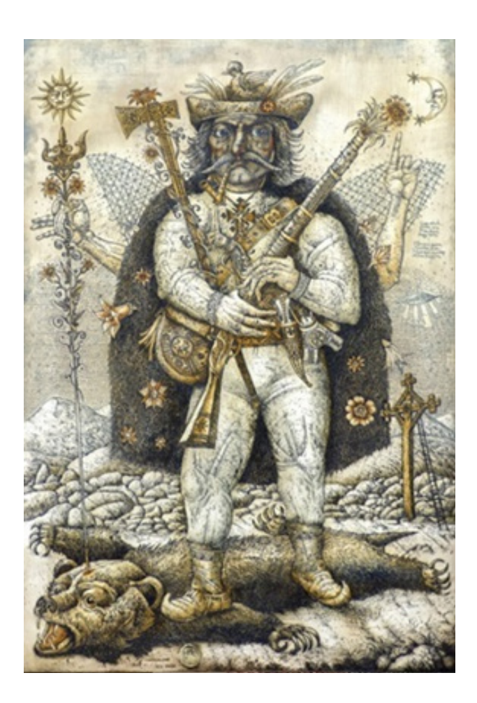
Figure 4. Denysenko O. "Successful Hunting". 2021. Gesography.