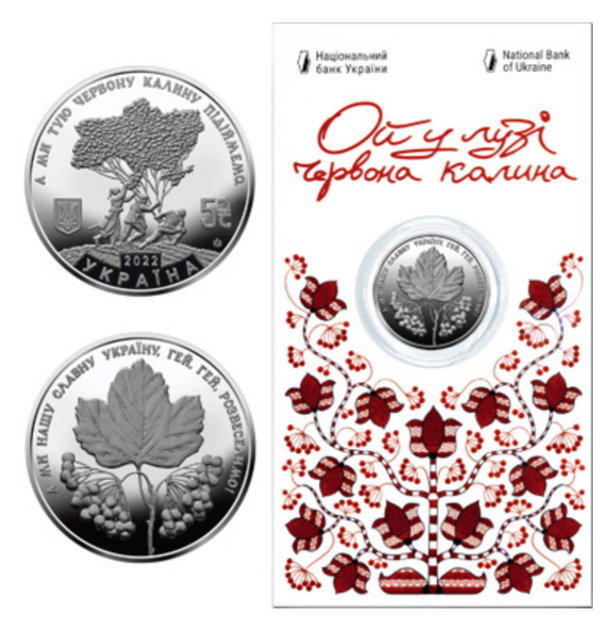
Figure 8. Commemorative coin "Oi U luzi Chervona Kalyna". D. Kryvonos, S. Ivanenko, V. Atamanchuk, 2022.

The work of Ukrainian jewelers during the war may indeed be considered the most striking example of it. Who needs the luxury of jewelry amidst the flames of war, one might wonder? But the jewelry business of Ukrainian masters continues to live. Moreover, nonstandard experimental searches appear and sometimes become so successful that they find keen demand and are quickly popularized. A jeweler is not only able to capture an image or emotions as painters and graphic artists do, but also possesses the unique ability to encapsulate the memory of an event which a person wants to immortalize in their soul, keeping it constantly nearby even at a tactile level—so that it can be felt and touched at any moment. Jewelry aptly fulfills this desire.