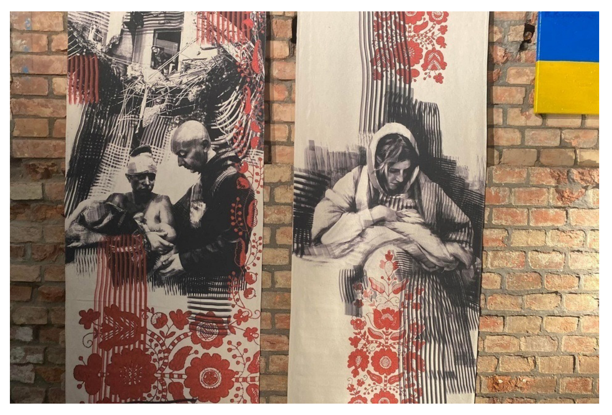
Figure 3. Project "Stand with Ukraine" Vienna, August 2022

the patronage of the world circus legend Lyudmila Shevchenko is in the process of being prepared. In April 2022, young Ukrainian circus artists, students of the Kyiv Municipal Academy of Circus and Performing Arts, acted at a charity show organized at the Princess Grace Theatre of Monaco in Monte Carlo where five charity shows with their participation were held. This young generation of circus performers brought prestigious awards from the circus festival in Monte Carlo. In April 2022, circus youth also took part in the show of the Monbijou Theater on the streets of Berlin. In May 2022, they participated in the international charity evening "Stojime za Ukrajinou" organized by the TV Nova company in Prague, and were actively involved in the show "Roads" organized by the Czech capital Cirk La Putyka. Ukrainian pop artists travelled with charity concerts throughout Europe. Artists came to their senses after the shock.