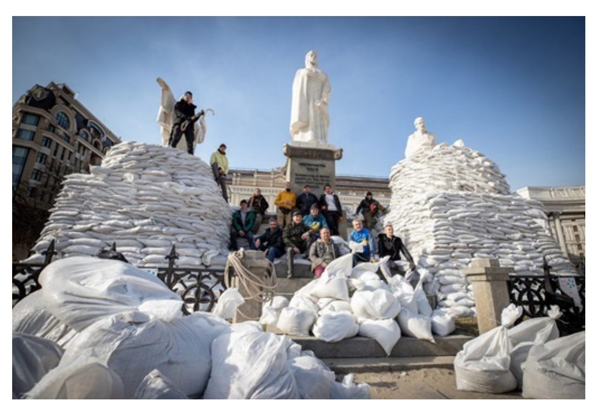
Figure 1. Ruins of the 18th century Transfiguration Cathedral in the city of Odesa. Photo posted on social media by the Odessans on July 23, 2023.