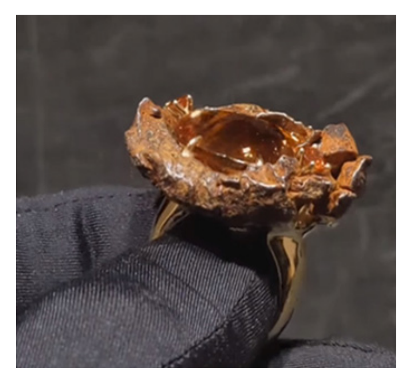
Figure 10. S. Drokin. "Ferauria" ring. Fragments of a shell, gold, garnet, citrine.

750 gold standard gold metal, steel fragments of a missile, spessartine garnet and citrine (Fig. 10).