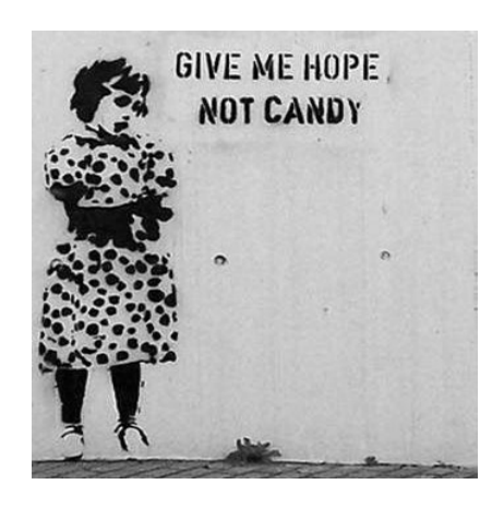
Figure 4. Give me hope not candy (Hiboocha)

The contextual antonymous pair 'hope' and 'candy' is introduced into the sentence asyndetically (without conjunctions). Significantly, the word 'hope', desire accompanied by expectation of or belief in fulfilment (Merriam-Webster), and 'candy', a sweet food made with sugar or chocolate (Merriam-Webster), are not antonyms, but they set against each other in the context, developing certain antonymous features. In my opinion, 'hope' embodies the power and strength that can help the younger generation survive and thrive, and as such, it contrasts with 'candy', which is used metaphorically to represent "sweet lies", something that distracts people from real, urgent day-to-day problems by pulling the wool over their eyes. The graffitist is quite vocal about the role of youngsters in laying the foundations for a new social and political order. Children are endowed with a clear, comprehensive vision of how the world should be and represent a new, conscious generation that needs real actions and is not going to tolerate beautiful lies.