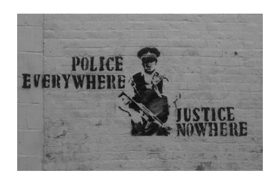
Figure 1. Police everywhere justice nowhere (Mecha)

First, we will consider some examples of explicit antithesis.