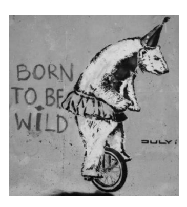
Figure 11. Born to be Wild by Banksy

The graffiti below illustrates the examples of implicit antithesis.