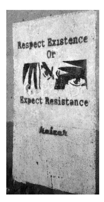
Figure 10. Respect existence or expect resistance (Twisted Rose)

In the graffiti above, antithesis and full rhyme bring about a far-reaching effect and intensify the idea. Once this phrase was used as a slogan of The Civil Rights Movement that proved to be very catchy and resonated with plenty of people around the world. It is straightforward, thought-provoking and memorable due to its rhyming form and radical juxtaposition of ideas. The graffiti stresses that failure to acknowledge and honour other people's rights and freedoms inevitably leads to resistance because everybody wants equal treatment and recognition of their inherent worth. The message of the graffiti is also reinforced by the graphical part that depicts a part of the face. The angry, disapproving eye expression shows how determined and serious the person is.