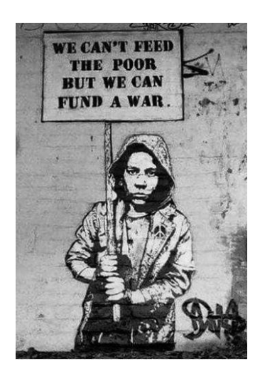
Figure 9. We can't feed the poor but we can fund a war (Emily, 2019)

Antithesis is generally moulded in parallel construction (parallelism). Parallelism refers to the repetition of sentence structure or word order to achieve a rhythmical effect (Tayeh et al., 2020, p. 367). It is a very powerful foregrounding tool as it highlights crucial points and improves the overall flow of the text, adding to the sense of cohesion and coherence within it, and thus guiding the audience through complex ideas. Parallelism can contribute to the aesthetic appeal of the antithesis, making it more memorable and engaging to a reader.