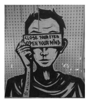
Figure 2. Close your eyes open your mind (Lisboa {Images}, 2013)

This graffiti became widely popular in the streets, and people started vigorously posting it on different social networking sites after a tragic event that shocked the USA and the entire world, when in 2020 a police officer brutally violated the law while arresting Afro-American, George Floyd, and accidentally caused his death.