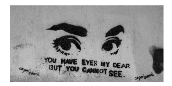
Figure 3. You have eyes my dear but you can't see (Lawlor)

context-driven. The antithesis highlights the inherent dichotomy between mind and body, spiritual and physical, action and inaction. The eye is a complex sensory organ that helps us see and perceive the world around. It is astonishing but the studies show that "our brains acquire about 90% of information from two senses only: sight (about 80%) and hearing (about 10%). The remaining 10% of information is distributed between smell, touch, and taste senses" (Man & Olchawa, 2018, p. 33). However, as a sophisticated instrument of vision, eyes can deter us from doing challenging things since the sight of potential threats fuels the feeling of great fear, which is a primal survival response to dangerous or stressful situations. Sometimes, it is our fear that paves the way for failures and missed opportunities. Consequently, the street artist brings to light the importance of being unbiased and perceptive of new ideas, making them key features of a modern, open-minded person.