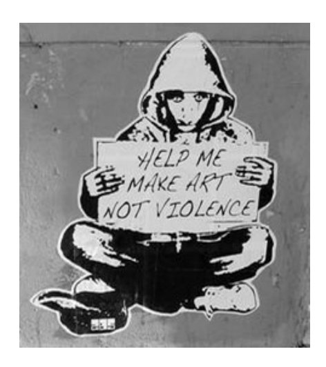
Figure 6. Help me make art not violence (Belluteau)

In the above pieces of graffiti, 'music' and 'art' stand in sharp contrast to 'war' and 'violence', becoming contextual antonyms. We may suggest that the street artists are uneasy about the raging wars and the growing rate of violence in the world. They use allusion to make readers interested in the graffiti by transforming a famous anti-war slogan "Make love, not war" that was coined by the hippie generation in the 1960s (Deep Blue, 2010). Significantly, the graffitists offer a viable solution to these acute problems that bring about destruction, death and mourning. The way out of a vicious circle of negativity is through peaceful activities such as art and music since they stir up strong, uplifting emotions and make the world a better place to live in. In this view, one Biblical statement comes to mind: "<...> overcome evil with good" (Romans 12:21). The graphical part of example 6 is immensely significant, as it depicts a beggar (the hat on the ground testifies to this), but instead of money the person asks to assist him in weeding out violence and probably planting the seeds of artistic beauty that later will produce positive results, because as a global community we have to work closely together towards a common goal since our number one priority is a peaceful, abundant life.