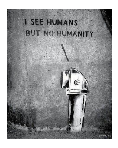
Figure 7. I see humans but no humanity

As can be seen from the example, the artist uses two nouns with the same root morpheme: humans – a bipedal primate mammal; a person (Merriam-Webster) and humanity – people in general; compassionate, sympathetic, or generous behaviour or disposition (Merriam-Webster) and creates a powerful juxtaposition, highlighting the contrast between two seemingly similar concepts. The graffiti discloses the artist's general perspective on humankind, emphasising that we have probably lost our distinguishing feature – the ability to be understanding and kind not only to other living beings' sufferings but also to the sorrows of our own kind. The picture of a periscope reinforces the dramatic effect of the antithesis. It indicates the artist's dissatisfaction with humanity that is, supposedly, moving in the wrong direction and has lost sight of what really matters.