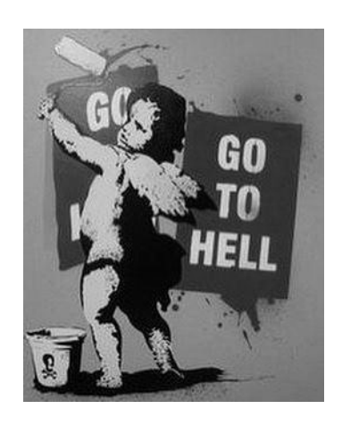
Figure 12. Go to hell (Benham)

The written part of the graffiti "Born to be wild" doesn't contain any cases of antithesis. Nevertheless, a more cursory glance at it allows us to see the powerful clash between the written constituent and the graphical one. The graffiti depicts a circus bear. A dangerous carnivorous animal, a predator that has not many natural enemies and is born to be wild, is kept as a pet. However, not only the combination of the text and picture but also the colour of the font enhances the antithesis. Red performs few functions in this graffiti. First, as an intense colour it has very high visibility, and thus attracts the recipient's attention. Second, it is strongly associated with blood, death and The IUCN Red List of Threatened Species. A masterly combination of the words and picture creates the antithesis that is brought to the fore by irony. The graffiti provides an insightful instance of the damage done to wildlife and nature and brings up a fundamental question of nature conservation and the way people treat animals.