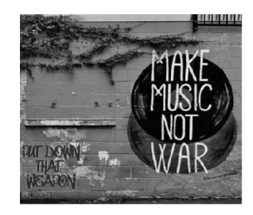
Figure 5. Make music not war (Hynes, 2020)

The contextual antonymous pair 'hope' and 'candy' is introduced into the sentence asyndetically (without conjunctions). Significantly, the word 'hope', desire accompanied by expectation of or belief in fulfilment (Merriam-Webster), and 'candy', a sweet food made with sugar or chocolate (Merriam-Webster), are not antonyms, but they set against each other in the context, developing certain antonymous features. In my opinion, 'hope' embodies the power and strength that can help the younger generation survive and thrive, and as such, it contrasts with 'candy', which is used metaphorically to represent "sweet lies", something that distracts people from real, urgent day-to-day problems by pulling the wool over their eyes. The graffitist is quite vocal about the role of youngsters in laying the foundations for a new social and political order. Children are endowed with a clear, comprehensive vision of how the world should be and represent a new, conscious generation that needs real actions and is not going to tolerate beautiful lies.