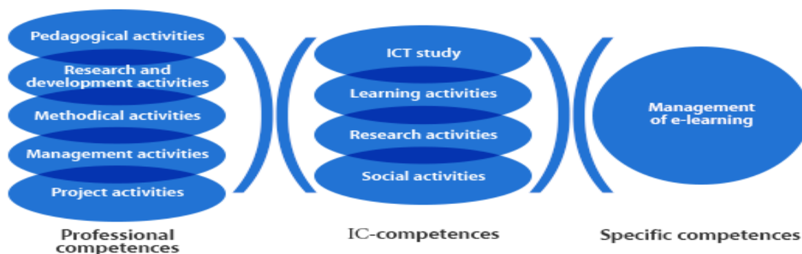
Fig. 1. Training manager of e-learning model, competence approach

For description and justification of the learning process at a certain specialization, individualization and flexibility was developed a generalized model of e-learning manager (Fig. 1). This model is an adaptation of the model ICT competencies of teachers and developed on the basis of their corporate standards of masters [6], the framework of competence of e-learning for teachers [7] and approaches to the development of ICT competence of masters by authored article.