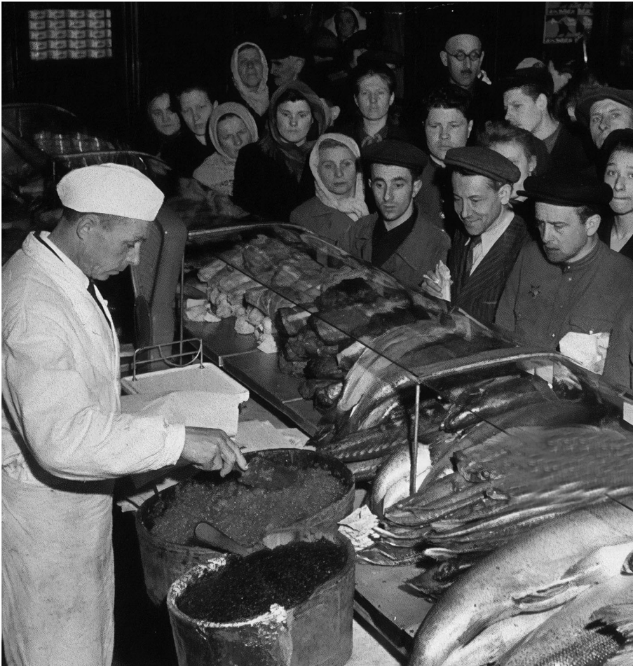
Figure 3 In a fish shop.