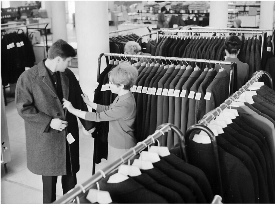
Figure 2 Soviet clothing shop.