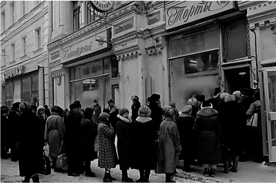
Figure 8 Melodya shop, 1991.

In the Soviet Union there was always shortage, the only variation being in the degree of unavailability of goods. Moscow was supplied better than most localities, of course; only some closed towns of the military-industrial complex lived better. When goods and produce became even scarcer, as in the mid-1980s, residents of the Moscow region and surrounding areas would go into the capital by train for shopping; and the famous comic riddle of that period about “long, green, smells of sausage” meant simply a train from Moscow. The system of commerce in the Soviet Union was in fact based on the lack of necessary goods. Hence the eternal queues, characteristic rudeness of the salesmen, physical struggles for whatever was “thrown out” onto the counter, embittered people regularly hanging around, trying to get hold of a scarce product through connections, etc. Not to mention the fact that even in the capital many of the products were of poor quality.