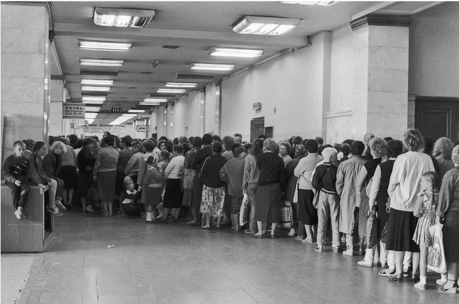
Figure 5 Queues in front of shops that are opening.

In conditions of commodity shortage, collective-farm markets rescued the public a great deal. These were either covered pavilions or open rows of counters, where they sold meat, milk, vegetables, fruit, potatoes and preserves. Representatives of collective or state farms and ordinary people who grew some crops in the countryside could trade in such markets. One had to pay for the trading space, and in return the market management provided everything necessary—scales, boxes and so on. Private sellers set prices depending on demand, and then the bargaining began (Figure 6).