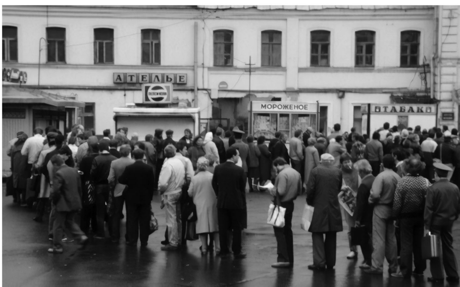
Figure 7 Stalls on Kolkhoznaya Square, 1990.

previous organization of commerce, as indeed Mikhail Gorbachev had done publicly in May 1985 in Leningrad. Shops were built on a standard pattern, and they tried to be located closer to the geographical center of a populated area. They were flat rectangular buildings, and nearly all of them still operate as a convenience even now: most often they house one of the discount stores.