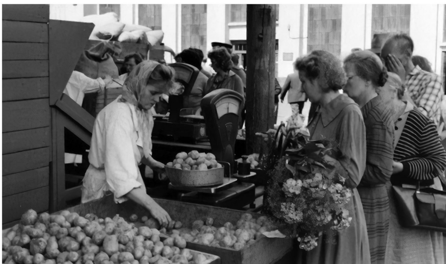
Figure 6 Farm Market.