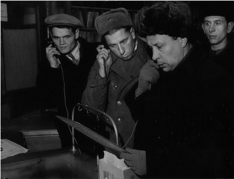
Figure 4 Collective listening to a record.

(Rosati 1994). Sometimes journalists came to the markets to do a “test for nitrates,” because in the late ‘80s this topic was one of the major concerns in daily life.