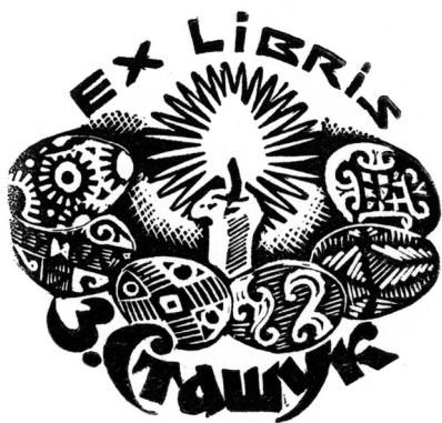
Opus 27 (2000) – Happy Easter (X6) For Z. Stashuk a small symbolic composition with a candle surrounded by Easter eggs: a favorite folk traditions for Ukrainians, who like to make “krashankas” – eggs painted by artists.