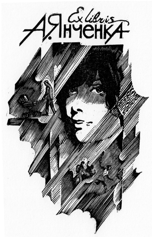
Opus 6 (1981) – View of Lady (X6) For A. Yanchenko, an early portrait, of the female face, romantic and transparent, with tiny figures as background. Untypical of the artist, whose images are rather abstract, but here the face is both a portrait and symbolic.