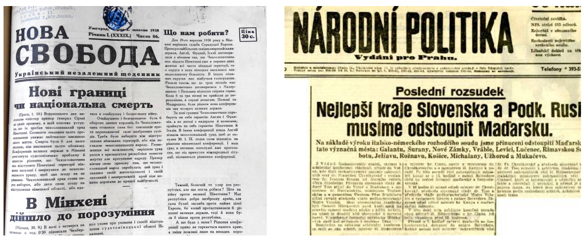
Fig. 2. Title pages of the publications "Narodna Politika" and "Nova Svoboda" with the headlines regarding new borders of Subcarpathian Ruthenia.

of France and Great Britain as well as political games of the fascist states, the government of autonomous Subcarpathian Ruthenia began to fight for its country virtually single-handedly against "Magyar revisionism, imperialism, propaganda, the former conqueror", seeking assistance of the German state.