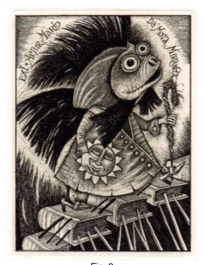
Fig. 3 Hrapov S. Ex-libris A. M. da Mota Miranda. C_3C_5 . 1997.