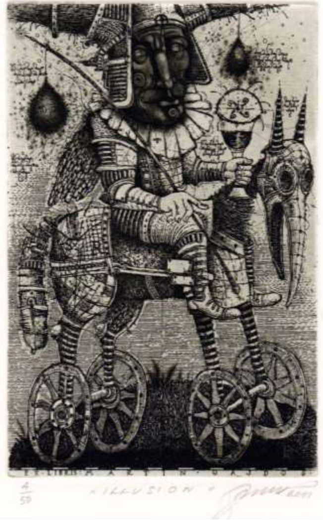
Fig. 2 Denisenko O. Ex-libris Martin Gaidos. C<sub>3</sub>. 2011.

Denisenko's works always have a deep philosophical meaning, he is a expert of allegory and stylization. The artist's ex-librises are owned by the most famous collectors of the whole world, which confirms the demand for the master in the international art market.