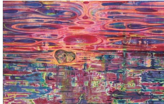
Figure 1 Huang Yuxing (黄宇兴), Enlightening , 2016 – 2018, acrylic, canvas, 230 x 320 cm.

smooth curves. The artist works with a wide range of colors and boldly applies them.