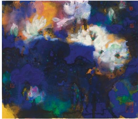
Figure 3 Lam Tian Xing (林天行), Daybreak (series Lotus ), 2017, ink, paper, 45 x 53 cm.

background, while the flow of pigments into each other create vibration of color.