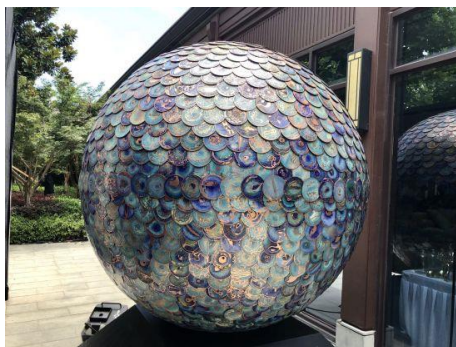
Figure 6 Shi Junyu (施君与), Ocean Star , 2019, copper, enamel, diameter 2 m, Shan Hai Jing.

‘internal’ and ‘external’; ‘content’ and ‘forms of embodiment’ [17]. Thus, the sphere itself is an embodiment of the image of the earth and the cycles in nature, and the picturesque enameled plates of fish-shaped eyes of different shapes give the impression of a natural matrix and total contemplation.