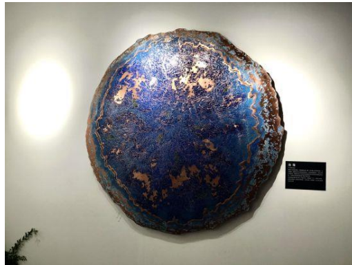
Figure 4 Shi Junyu (施君与), Swim , 2018, wall enamel installation, diameter 1 m.

color of the emperor and the whole of China [5]. The combination of yellow (gold) and blue in the works of artists is a symbolic combination of earth and sky, feminine and masculine. This color symbiosis appears throughout the work of Shi Junyu.