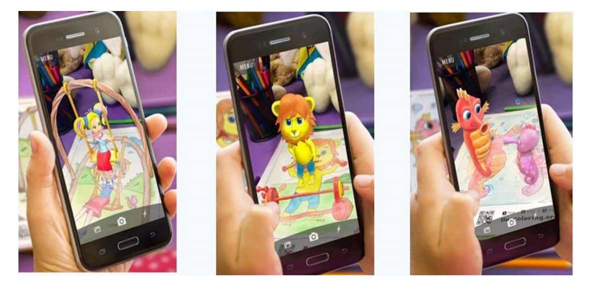
Figure 1: Activation of coloring pages with augmented reality Live Coloring.

In the play activities of preschoolers there is an opportunity to use an interactive game set "Animal Cube", which consists of soft toys (monkey, elephant, parrot, panda) with a special cube. By scanning the cube corresponding to one of the toys with the help of the Varus Animal Cube mobile application on the Play Market and App Store platforms, the educator activates