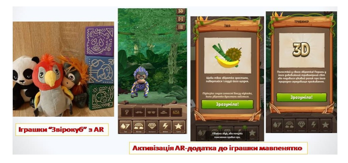
Figure 2: Activation of augmented reality of the game set "Animal Cube".

the game of preschoolers with a virtual animal that "lives" inside. Children can enter the reality of their pet and observe the wonders of wildlife, as well as explore the 3D habitat of exotic animals with ARKit or ARCore. Each of the four groups of preschoolers can look after the animal selected from the play set, learn how to take care of the animal: feed it, train, decorate, play and actively interact with it (figure 2). Teachers of preschool education institutions can organize the activities of preschoolers to take care in the virtual world of exotic animals that are endangered in their natural habitat. Thus the tasks of game, sensory-cognitive and research activity for acquaintance with animals are realized.