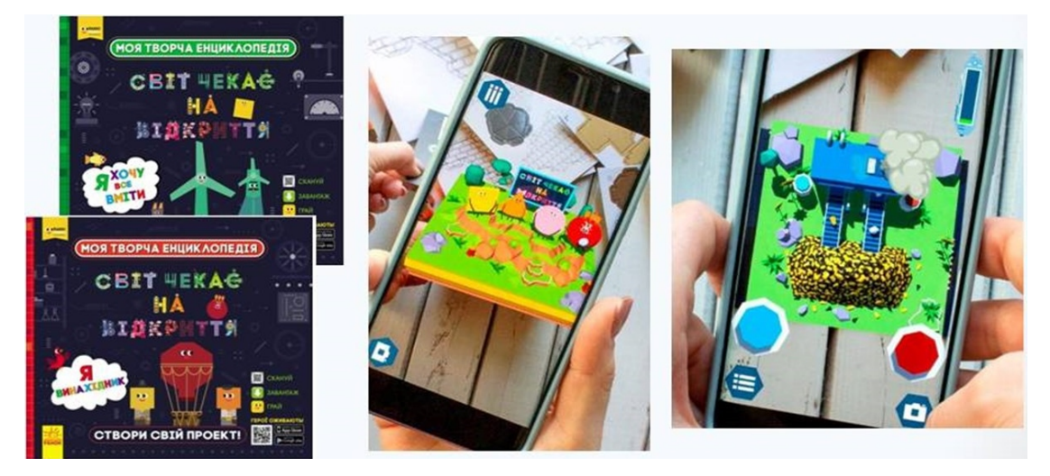
Figure 3: Activation of augmented reality in the book "My creative encyclopedia".

initial knowledge of modeling, techniques and technologies, types of arts and crafts, i.e. what the future inventor needs to know.