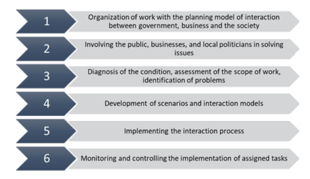
Figure 3 – Stages of interaction between government, business and society to solve certain problems

As of 2020, the biggest problem for the population is health care (69%) and the fight against corruption in the city government (28%) (Ilko Kucheriv Foundation for Democratic Initiatives, 2020). Corruption is the key factor in solving the issue of territorial community development. For example, the profitability of some Ukrainian OTGs population does not depend on the size of the city or its business activity. In the absence of corruption in governing bodies, some small territorial communities could organize local businesses and provide their population with high wages and infrastructure development (Kazyuk, 2021). The government's initiative in establishing effective tripartite interaction becomes the key to rapid regional growth. Even though the interaction of government, business, and society is a continuous process, this process is carried out in stages in solving specific tasks. The author's team defined six stages of the interaction of authorities, business, and society to solve certain problems, which are reflected in Fig. 3.