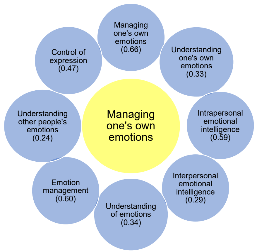
Fig.2. Correlation of the indicator of "Managing one's own emotions" with other indicators of emotional intelligence (significant at p<0.05)

Figure 2 presents the results of correlation analysis, which demonstrate a significant positive correlation between the indicators of "Managing one's own emotions" and "Managing other people's emotions" (0.28)