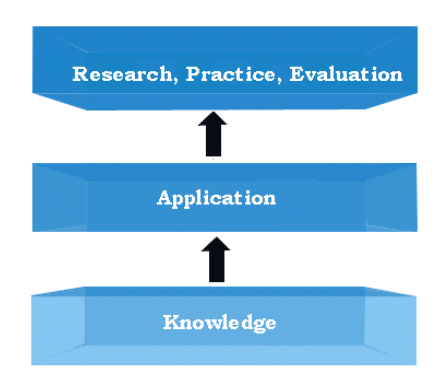
Figure 1. KAR-P-E taxonomy [7, p.37].

Teacher training strategies are included in the SQD (Synthesis of Qualitative Data) model, which components are: educators who are role models and who understand the role of technology in education, teaching how to use technology through design, collaborating with colleagues, scaffolding authentic technology experiences, providing constant feedback [8].