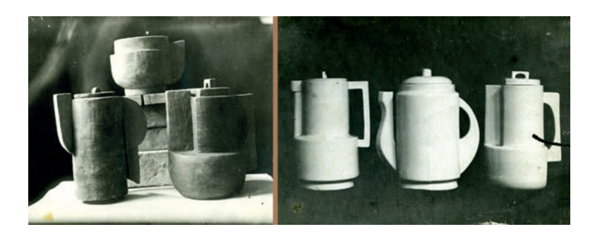
Рис. 7. Проєкти і втілені у фарфорі геометризовані чайно-кавові форми кінця 1920-х – поч. 1930-х рр.

materials of the Central State Archive-Museum of Literature and Art of Ukraine preserved photographs of design projects and embodied in porcelain (stone mass?) Works of the sculptor (fig. 7).