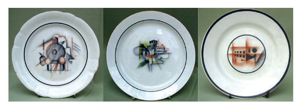
Рис. 6. Бойчукізм. Тарелі з розписом П. Мусієнка. Фарфор. 1920-ті – поч. 1930-х pp. 36. НМУНДМ.

It is important to note that the search of Mezhyhirya masters forming was related mainly to folk ceramics and sculpture, in the dishes they implemented only designer paintings in the style of boychukism (fig. 6).