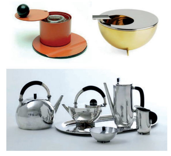
Рис. 1. Маріанна Брандт. Кавоварка, попільничка і сервіз для кави й чаю. 1924—1926, 1928—1929 рр. Баугауз.