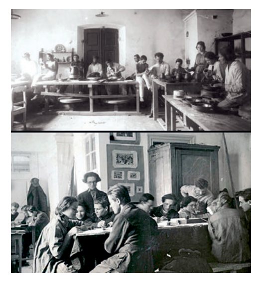
Рис. 4. Заняття в керамічній майстерні та вивчення графіки у Межигірському технікумі. 1920-ті рр.