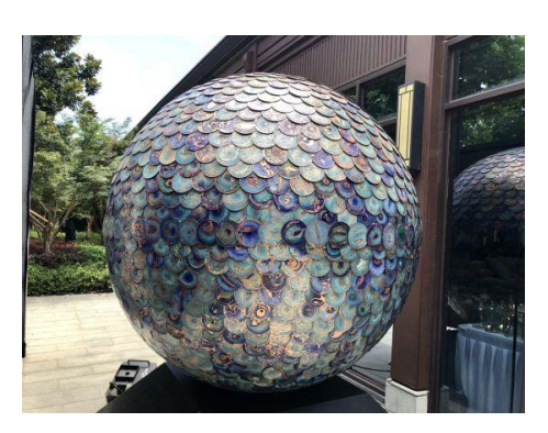
Figure 6 Shi Junyu (施君与), Ocean Star , 2019, copper, enamel, diameter 2 m, Shan Hai Jing. (Photo: open source).

'internal' and 'external'; 'content' and 'forms of embodiment' [17]. Thus, the sphere itself is an embodiment of the image of the earth and the cycles in nature, and the picturesque enameled plates of fish-shaped eyes of different shapes give the impression of a natural matrix and total contemplation.