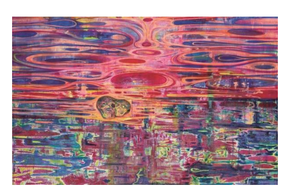
Figure 1 Huang Yuxing (黄宇兴 ), Enlightening , 2016 – 2018, acrylic, canvas, 230 x 320 cm.

smooth curves. The artist works with a wide range of colors and boldly applies them.