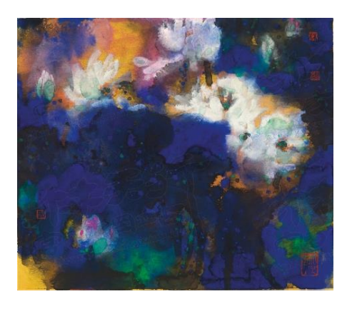
Figure 3 Lam Tian Xing (林天行), Daybreak (series Lotus ), 2017, ink, paper, 45 x 53 cm.

background, while the flow of pigments into each other create vibration of color.