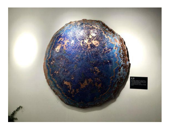
Figure 4 Shi Junyu (施君与), Swim , 2018, wall enamel installation, diameter 1 m. (Photo: open source).

color of the emperor and the whole of China [5]. The combination of yellow (gold) and blue in the works of artists is a symbolic combination of earth and sky, feminine and masculine. This color symbiosis appears throughout the work of Shi Junyu.