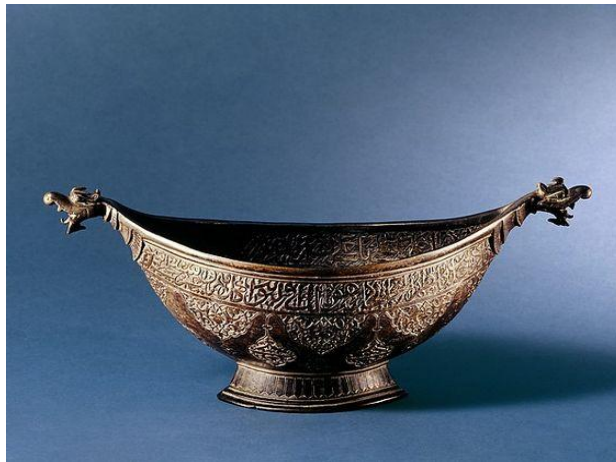
Figure 5. Beggar’s bowl (kashkul) from Deccan, Bijapur Province, India, made around 1600; tinned bronze, casting, engraving

Although the religious practices of Mevlevi and Alevi-Bektaşî varied greatly, they were united by a common desire for unity with God for all Sufis and love for the whole world. According to the doctor of Turkology, Kaim (2017) , adherence to Sufi ideas that contributed to the development of the “intellectual life of Islam and strengthened people's faith was for many centuries the dominant feature of Ottoman religiosity” (2017). Bowls for alms in India and Pakistan, for example, often become magical objects of power, because they were used for certain movements in the centre of the dervish group circle (for example, a kashkul from Deccan, made around 1600, and a kashkul from Kashan from 1913-1914) (Figure 5). It was a common practice to manufacture some beggar’s bowls with special notches for fingers, “especially for the rituals where the item was handed from one dervish to another, as a sign of fine energies of changing owners with the feature to be accumulated and multiplied” (Kashkul and the dervish’s..., 2015).