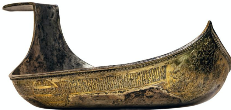
Figure 7. The dipper granted to sacristan Bogdan Silin 1650, the Armoury of the Moscow Kremlin

In general, niello application is considered one of the oldest ways of decorating art products made of precious metals (silver and gold). This technique reached an extraordinary peak in the Byzantine-Kyivan Rus period of the tenth-twelfth centuries. For example, one of the dippers stored in the Armoury, made using the technique of raising from a single sheet of silver up to 2 mm thick. It is decorated with engraved inscriptions and ornaments using the blackening and gilding techniques (Figure 7). This method of precious materials tinting is so stable that it does not lose its beauty for centuries. For the first time, the detailed technology of this alloy was described in a Benvenuto Cellini's (1500-1571) treatise on jewellery art, which indicates the composition and methods of preparing niello.