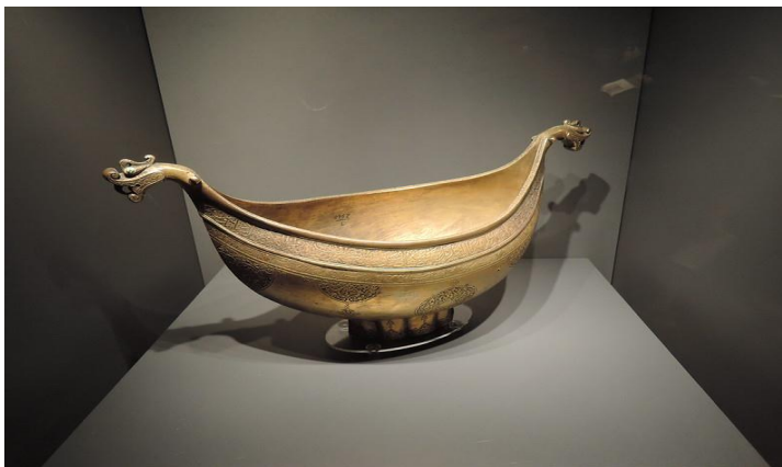
Figure 1. Kashkul in the shape of a golden longship with two handles with dragon heads with the holes drilled

Nowadays, the Istanbul Museum of Islamic and Turkish Art holds a boat-shaped item. According to the data of the mentioned collection exposure labelling, this item, under the inventory No. 2960, there is a kashkul (a beggar's bowl) (Nematzade, 2020). Whereas, it is attributed as an artefact from the Sefevidian era of the early 17 th century (obviously, based on the fact that it was covered with gold of the certain ornamental decoration type). But, taking into account the item production from precious metals and its evident resemblance to the boat shape (Figure 1), widely spread in the Old Russian, Byzantine jewellery, and in the Scandinavian shipbuilding tradition, sources of inspiration of the item stated should be verified. It is decorated with friso with inscriptions along the upper edge; along the bowl bottom side, rondal arabesque-ornamented compositions are distributed (Persia, the beginning of the 17 th century; collection of the Istanbul Museum of Islamic and Turkish Art, Turkey) (Arslan, 2020).