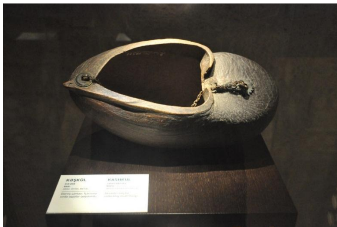
Figure 6. Kashkul of the Sevefid period from the collection of the Shirvanshah's Palace in Baku (Azerbaijan)

However, in general, it should be noted that the majority of the Iranian kashkul samples have the shape of half a walnut with a notch in the core. A typical example is an exhibit from the 19 th century Shirvanshah's Palace in Baku (Azerbaijan) (Figure 6). These items differ a lot from the longships of Byzantium and Kyiv Rus boat, dipper, small dipper, flagon, grace cup, mostly related to the custom of tasting wine during rituals, holy services and church holidays.