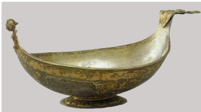
Figure 2. Small dipper that belonged to patriarch Nikon (Moscow, 1657; silver, casting, carving, chasing, gold-plating; collection of the museums of Moscow Kremlin)

Similar cast objects in the form of a silver gold-coated boat on legs, decorated with embossing and carving, referred to as small dippers, are shown on the aforementioned Web page in the section with the same name (Moscow Kremlin Museums..., 2020). They were of small size, as represented by a small dipper from the Patriarchal Palace of the Museums of the Moscow Kremlin, which belonged to Patriarch Nikon (Figure 2). The stated exhibit was cast from silver and decorated with carving, embossing, and gold-coated ( Swan et al., 2017 ). Its size depended on the function, for such objects were intended for containing strong drinks. On account of the use of precious metals and various complicated techniques for the art processing of metal, mostly wealthy people can afford buying these goods ( Hattap, 2019 ).