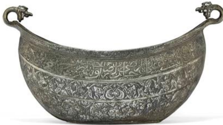
Figure 4. Kashkul of the Timuridian era of typical shape, without a support (Northeast Iran, 15 th century)

Tinned copper, engraving is decorated along the bowl upper edge with frieze with an inscription a-la naskh, with an ornamental vine-shaped frieze below it, with lotus flower motives along the lower part. Handles ended like dragon's heads, turned with their mouths inside the bowl, 31, 2 cm in diameter.