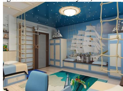
Monumental panels with transport themes elements