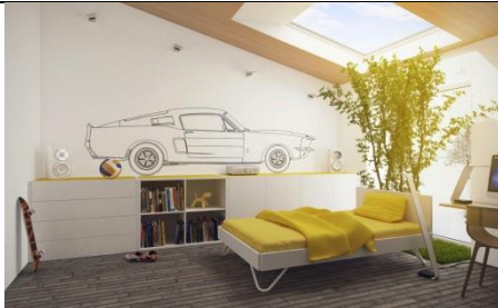
Table 1. Examples of children's interiors with different design techniques in transport.