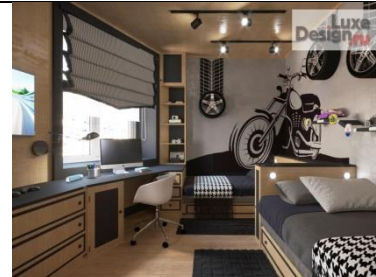
Ornamental and graphic compositions (images cars and motorcycle)