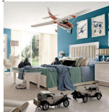
Children's toys in the form of various types of transport (from wood or other ecological material)

Now let's dwell in more detail on these techniques. The use of thematic graphic images on the walls of the interiors of social protection institutions for children is typical for different rooms. These can be different purpose rooms (rest rooms, study rooms). Decorative monumental panels should be used both in interiors (in large rooms) and in exteriors. In the above-mentioned institutions such premises include: dining rooms, game spaces (rooms) and recreational areas (Figure 3).