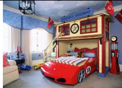
Furniture use of transport symbols