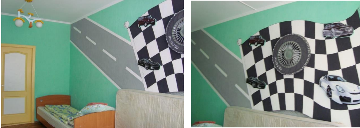
Figure 1. The theme of land transport (cars and bicycles) in the interior design of social protection institutions for children is the "City of Happy Children" in Kyiv.

first skills in the bicycles design. The logical continuation of this career guidance technique would be to use the bicycle image in the interior design of children social protection institutions.