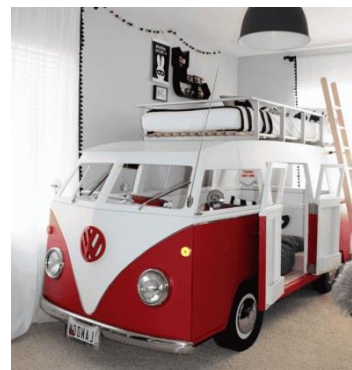
Models of airplanes, cars, - as objects of design