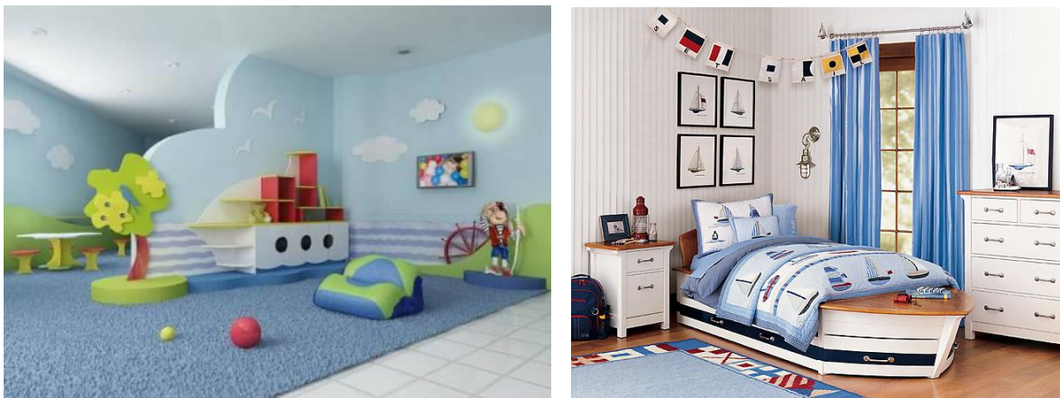
Figure 2. The theme of sea transport (images of a boat, yacht and steamer) in the interior design for children.