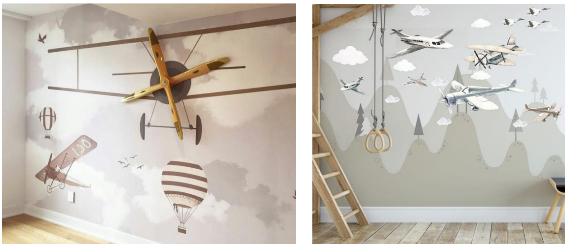
Figure 3. The theme of air transport (represented in the interior design by images of an airplane) in the interior design for children.