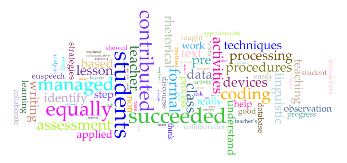
Figure 2. Word Cloud That Rates the Use of the Keywords in the Observation Reports

The most frequent collocations with strong correlations were as follows: 'students-coding' (r=1).'students-contributed' (r=0.9688),students-progressed (r=0.9593),'contributed-activity' (r=0.9512),'contributed-equally' (r=0.9429),'equally-managed' (r=0.9322)'equally-collaborated' (r=0.9301),'succeeded-analysis' 'succeeded-coding' (r=0.9277),(r=0.9251)'managed-strategies' (r=0.9119),'managed-discourse' (r=0.9091) (see Figure 2).