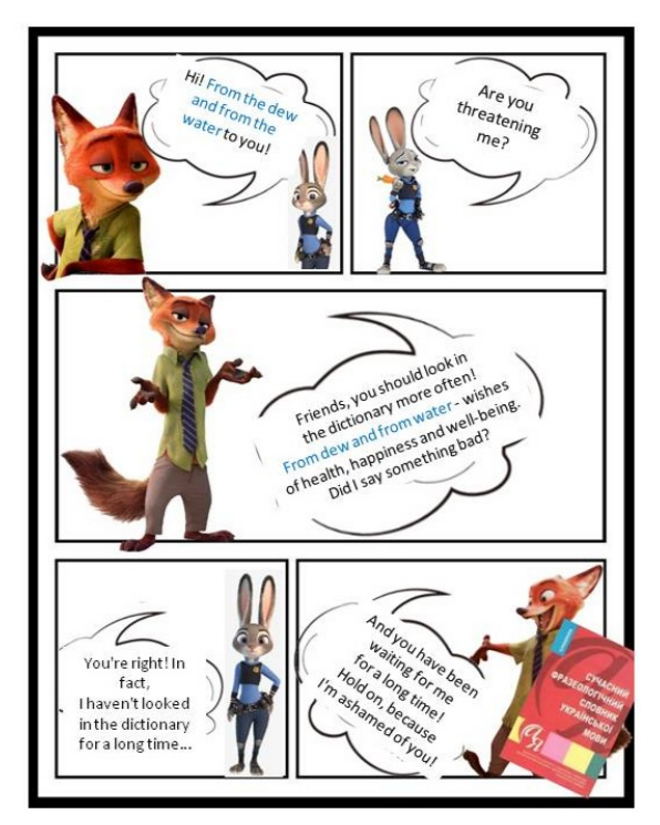
Figure 1: Example of a comic created using the Pixton online service.

The next program that can be used to create comics in primary school is Comica. This is an app