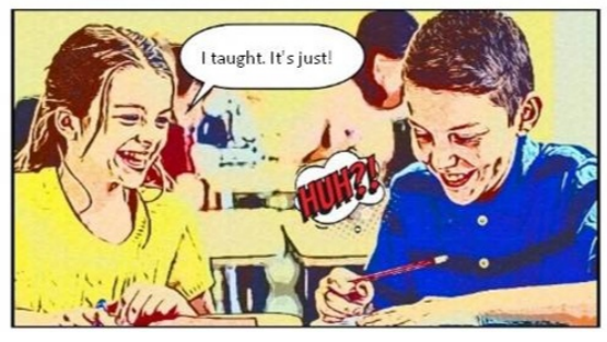
Figure 3: Comic Book Editor Comica.

to create and use comics in educational practice. Appropriate criteria and levels of readiness have been identified and developed.