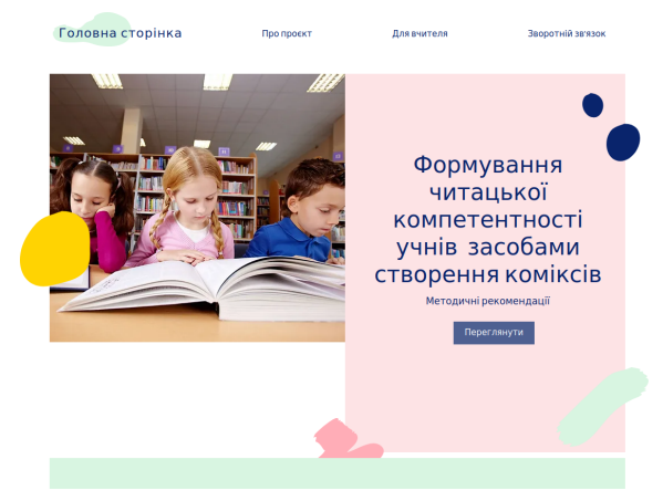
Figure 4: The main page of the developed website.

The homepage provides a brief description of the project, links to articles, and a contact window where anyone can contact the author of the website if needed. At the top, the site menu is presented, which is intuitive and allows the user to go to the following categories (figure 4).