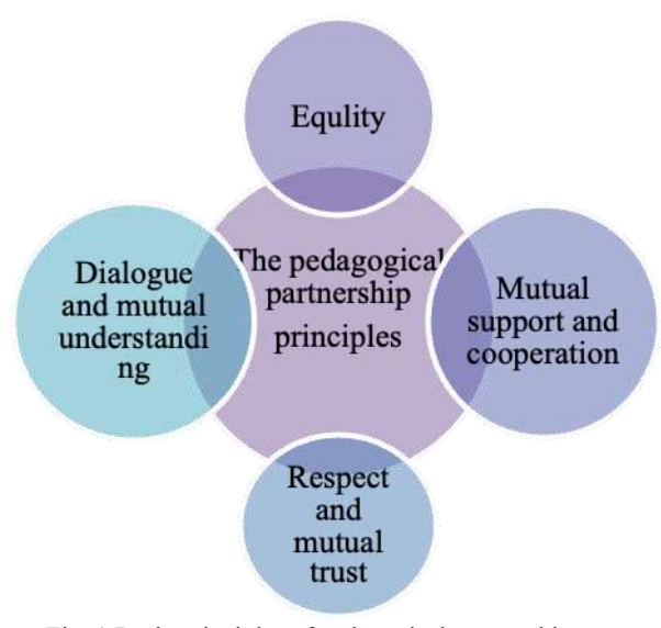
Fig. 1 Basic principles of pedagogical partnership

Partnership pedagogy is based on the principles of voluntariness, equality, democracy, and respect for the individual in terms of the outlined norms (rules, requirements, duties). Each party values and foresees active cooperation in the performance of joint educational tasks under each party's responsibility for the obtained results, [13].