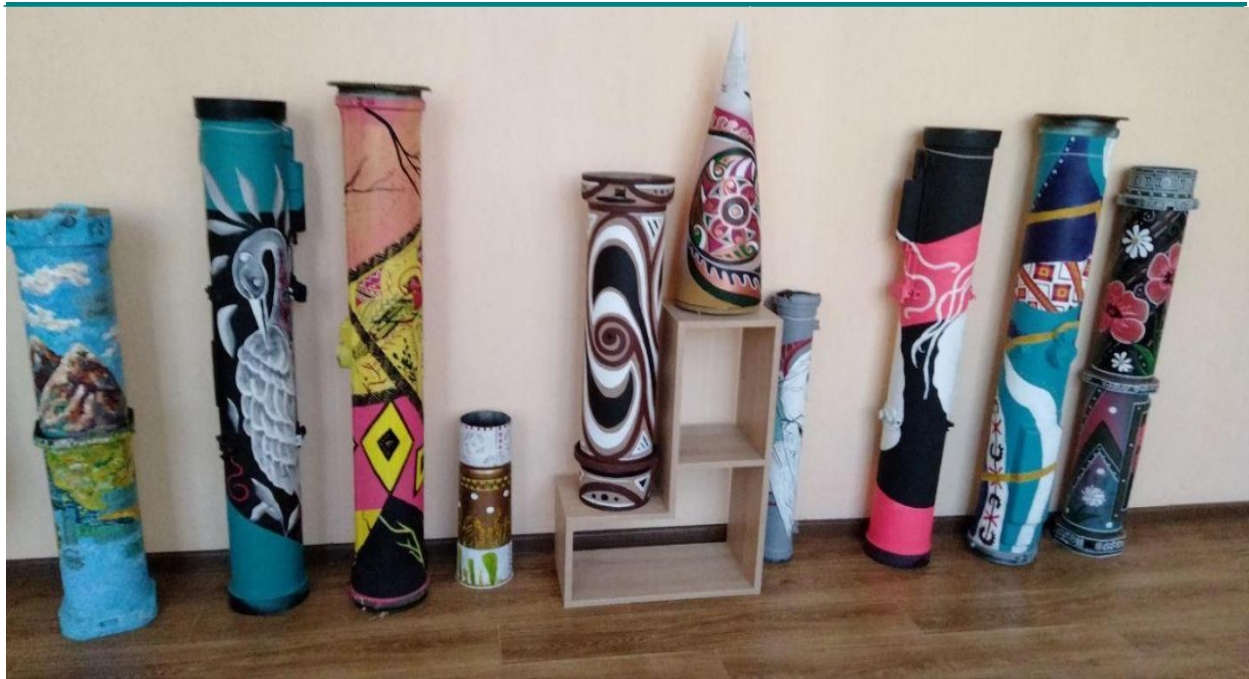
Creative projects of painting tubes from shells by teachers and students of the college