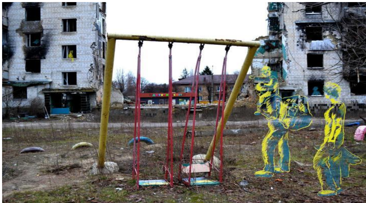
“Retur” by Elena Kazimirenko