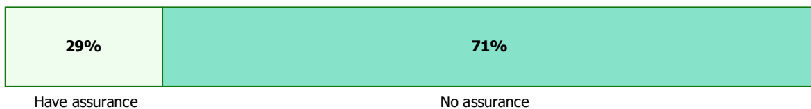
Figure 3. Assurance of anti-corruption information.

Around 95% of companies publish an average of 997 words of anti-corruption information. The nature of anti-corruption information disclosure varies greatly across jurisdictions (Figure 3) [22, p. 4].