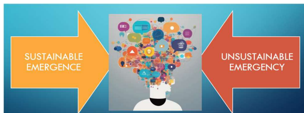
Figure 3: Pathway to Trans-digital Educational Communication

As a result, the structure and modelling of two transdisciplinary dimensions of digital educational communication are suggested: 1) endocentric (the transdisciplinary interoperability of CONTENT, TOOLS, INTERACTION OUTPUTS of educational communication); 2) exocentric (the transdisciplinary interoperability SKILLS, COMMUNICATION, MEDIA, OUTCOMES of education) – Fig. 4: