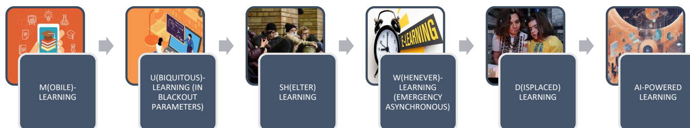
Figure 5: Emergency-Informed AI-enhanced Learning Formats Evolution for Resilience

Transformative communicative model of digital education facilitates the identification evolution directions of e-learning formats, informed by the space-time constraints of the global quarantine measures and wartime measures (Fig. 5).