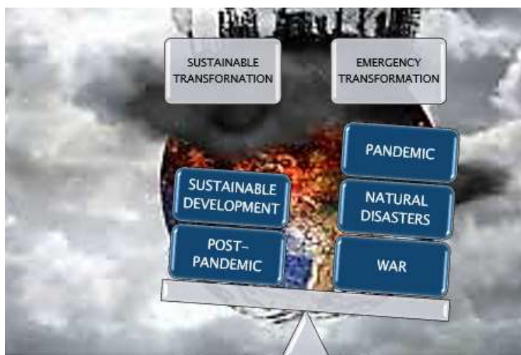
Figure 2: Dimensions of Transformation for Digital Education

Thus, the fundamental transdisciplinarity, that COVID-19 digital procedural transformations imposed on the educational process in the area of Foreign languages acquisition, is verified by a unified framework of correspondence between the components of a crucial communicative competence [19], comprising of a diverse skillset, and various aspects of ICT competence in Arts and Humanities [3; 12; 13; 39], utilized in the educational process, elaborated for the purposes of this study.