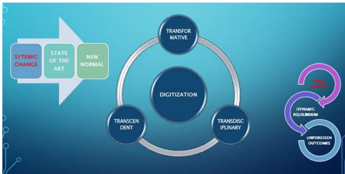
Figure 1: Conceptual Grid Dynamics of the 3T Model

digital education: transformation, transcendence, transdisciplinarity (Fig. 1). These dimensions are conduits of vertical (endocentric) and horizontal (exocentric) transdisciplinarity of digital education as a cohesive system.